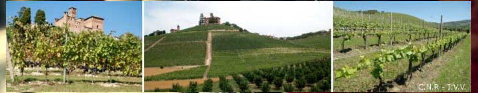
CNR experimental vineyard images

A decisive help to our research came from the Piedmont Region which, thanks to a far-sighted work of preservation of bio diversity, carried out by the CNR Institute of Plant Virology in Grugliasco, has created a vineyard-database near the castle of Grinzane Cavour in which are preserved all the varieties of table and wine grapes that have been, or are still, cultivated in Piedmont and that could be identified. We also went several times to the Bonafous Experimental winery in Chieri, managed by the University of Turin, and thanks to their splendid availability we had the chance to taste many wines obtained with microvinifications from grapes recovered by the Piedmont Region, it seemed they had the potentiality to give the best wines.