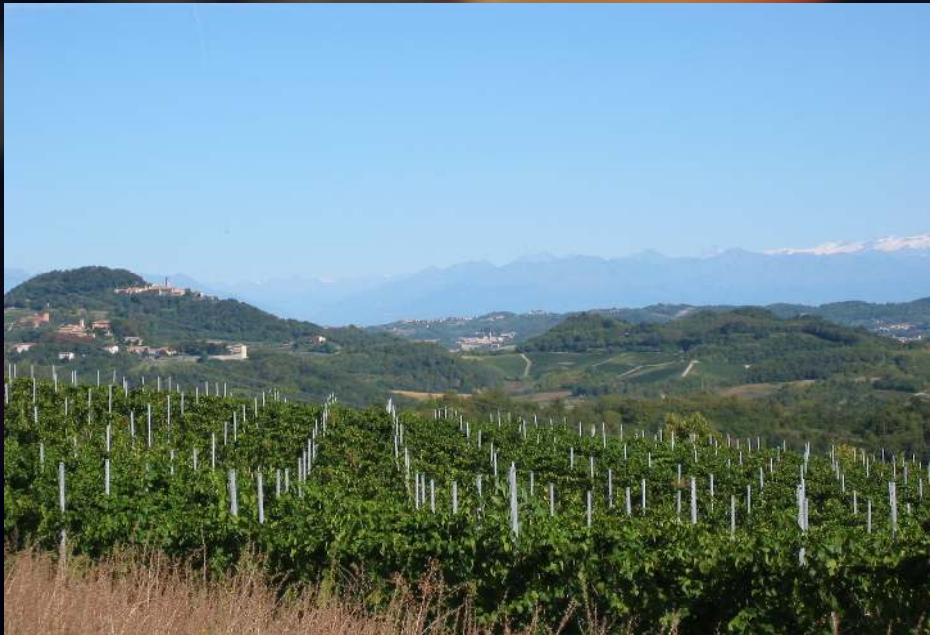
Vineyard "Bargero" Slarina

In 2016 we planted about 1 Ha. of Slarina and in 2019 1 Ha. of Baratuciat with a big financial and time commitment for our possibilities. We also began to increasingly characterize our winery as strongly focused on the native grape varieties of our area with a view to preserving bio diversity.