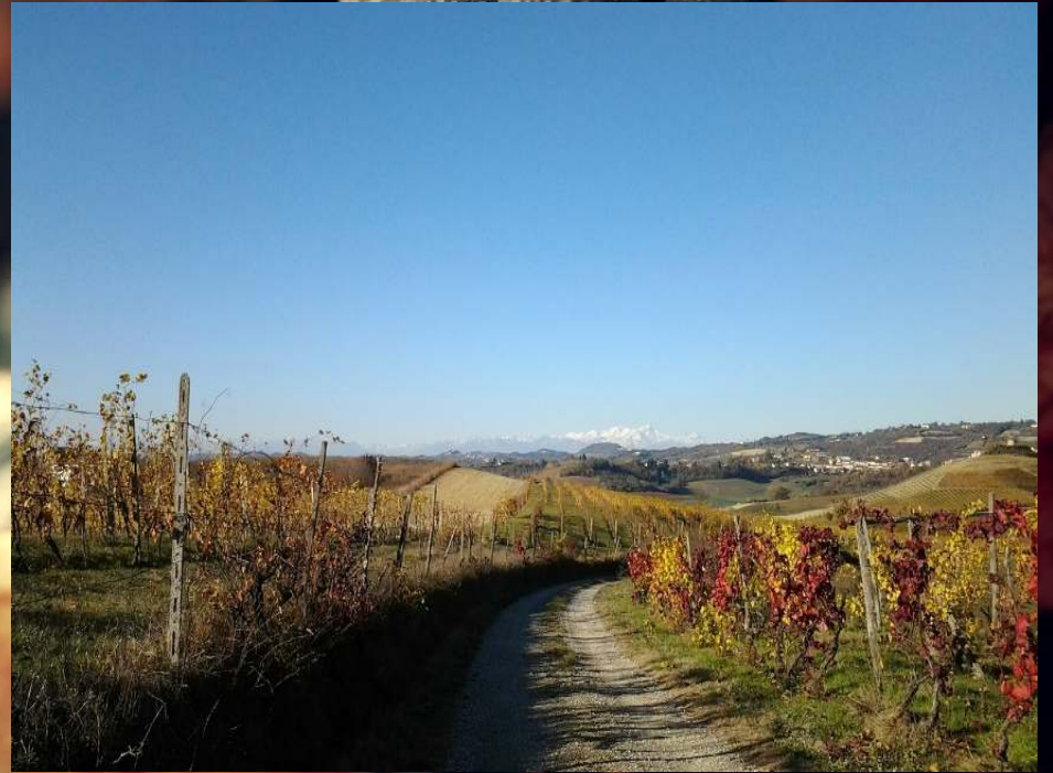
Trails in the Monferrato Hills

From this episode arose in Fabio and me the desire to realize a desire that had been smoldering in us for some time: to recover old varieties of native wine grapes that had been lost or were at risk of extinction.