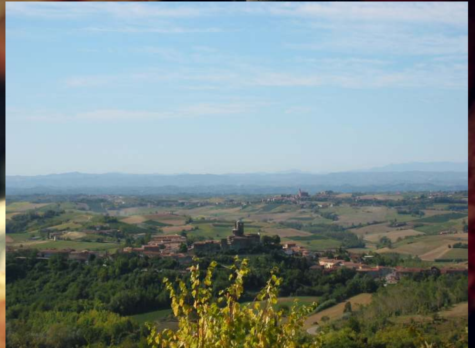
Panorama from our vineyards