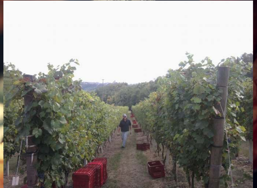
Grape harvest in baskets

In 2018 we harvested the first vintage of Slarina and decided not to put it on sale but to use all the wine obtained to make several tests, in large barrels, tonneaux and in steel in order to realize which was the most suitable processing. The same thing we did with a small quantity of Baratuciat which we obtained with the 2020 harvest.